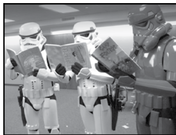
Right: Members of the Star Wars Midwest Garrison take time out for reading at May the Fourth Be With You .