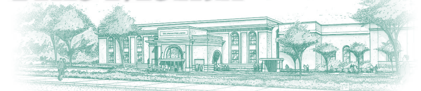
Rendering of library expansion by Ray Lytle.